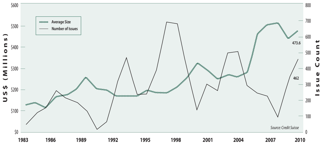
CHART 1: AVERAGE SIZE AND NUMBER OF NEW ISSUES (Proceeds)

ratio of small issues (43.5%) was more conservative than the corresponding number for large issues (46.4%). Thus, viewed in this highly aggregated way, it appears that smaller issues are not riskier from a default point of view than larger ones and may be a bit safer.